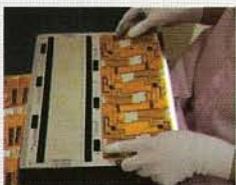
PCB on Tacsil