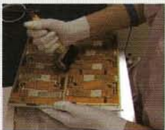
Fixing with rubber roller